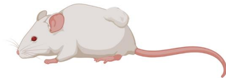
Figure 3. PDX mouse with visible tumor. This is a PDX mouse with a visible tumor growing on its back.

Let's look at an example of what the tumors look like on a PDX mouse: