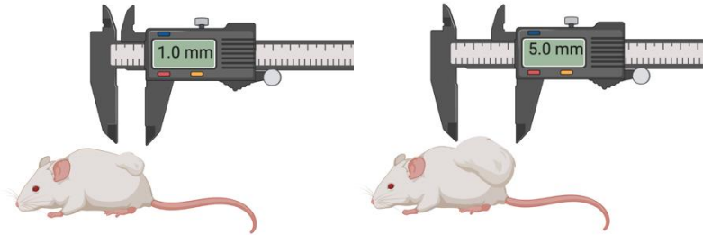
Figure 4. Calipers are used to measure PDX tumors. Patient-derived tumors are monitored on the mice by measuring their diameters before, during, and after treatments using calipers to measure down to the millimeter.

compare the size of the different PDX tumors, we would use calipers, a device that can measure the diameter of each tumor down to the millimeter. The caliper is non-invasive and can be used externally on a living mouse.